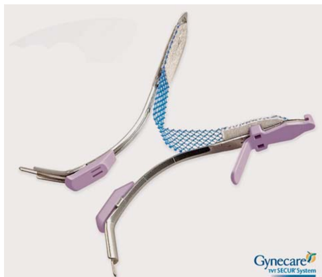
Fig. 1 TVT Secur® sling (Gynecare).

The data available from the literature vary between 40 and 87% [14–20]. Investigations in our own hospital showed a continence rate of 63%, with 23% improvement. However, recent data from 2010 indicate overall high efficiency, with continence rates of more than 80% and negligible side effects. In 2010, Tincello et al. introduced a TVT S global register with a total of 676 patients from 29 centres and, in a 12 month follow-up, found an objective continence rate of 84.8% with overall minimal complications [22]. The data from Han et al. [23] from the first two years also