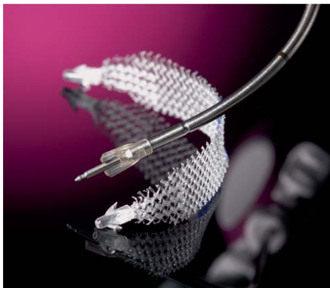
Fig. 2 MiniArc Precise® sling (American Medical Systems).

U: U-position; H: H-position (Hammock); RH: residual urine