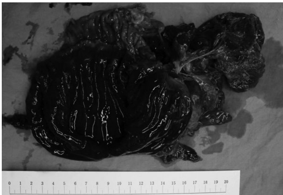
Figure 3 The opened, huge, dark-reddish strangulated stomach, 14 cm in maximal length, with blackish necrotic mucosae.

Traumatic diaphragmatic injury is a recognized consequence of high-velocity blunt and penetrating trauma to the