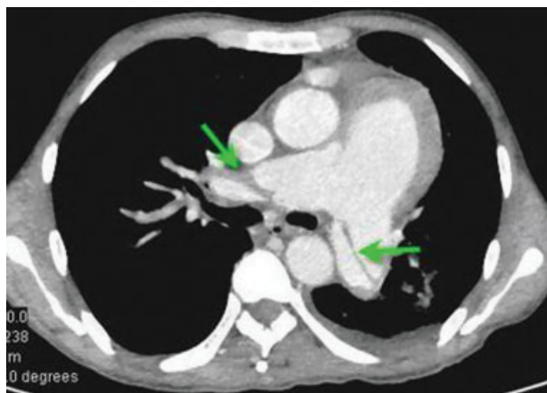
Figure 2 CT showing dilatation of the main pulmonary artery and the dissection involved left and right pulmonary artery (arrow).

The symptoms of pulmonary artery dissection are non-specific. The most common symptoms are chest pain, dyspnea, cyanosis, hemorrhagic shock, acute pericardial tamponade, and sudden death. In the patient described herein, the clinical diagnosis was facilitated because of the