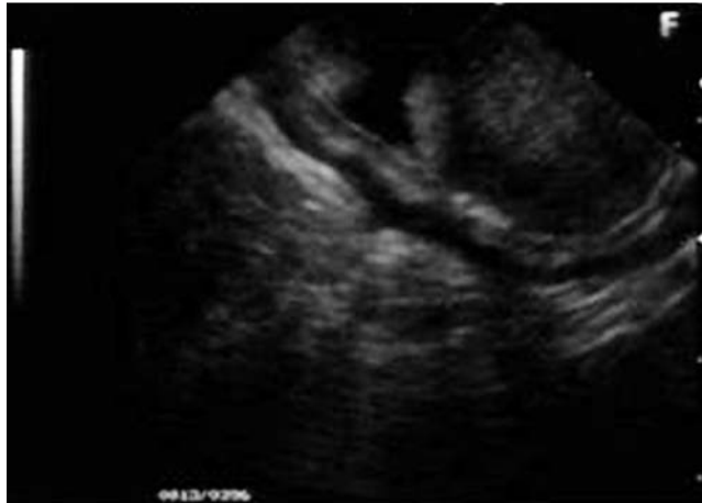
Fig. 1 Endoscopic ultrasound in a 51-year-old woman with epigastric pain and weight loss showing a hypoechoic, homogeneous lesion with indistinct margins originating from the submucosal layer. The muscularis propria layer was intact and not involved.

IFP is a rare mesenchymal lesion of the gastrointestinal tract. It has been regarded as a reactive polyp, but recent studies have indicated malignant potential [1]. Surgical resection is the generally accepted treatment modality in these cases because of the relatively large tumor size and difficulty in endoscopic resection using standard electrosurgical techniques [2]. There are few reports of endoscopic snare resection of gastric submucosal lesions. The “ligate and let go” method, after endoloop insertion, allows the lesion to slough spontaneously [3]. The limitation of this technique is the difficulty in specimen retrieval; therefore it may not be a suitable option for solitary submucosal lesions in which the pathologic evaluation indicates a need for surgical intervention. In another study, ligation and resection were carried out in the same session [4]. In our method, the interval between liga-