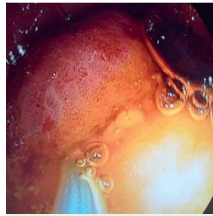
Fig. 3 Snare excision of the polyp.

tion and resection allows the blood supply to deteriorate, causing ischemia and subsequent reduction in the size of the stalk and facilitating resection of the lesion.