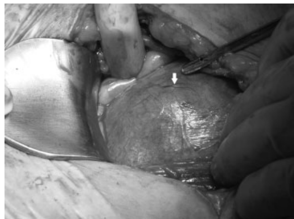
Figure 3 Uterine scar dehiscence during repeat cesarean. Lower uterine segment after opening of the parietal peritoneum (case 1). Particles of fetal vernix (white arrow) and fetal parts can be visualized through complete uterine scar dehiscence.

time, she underwent labor induction with a Foley catheter and oxytocin because of severe preeclampsia and intrauterine growth restriction. Twelve hours after oxytocin initiation, no significant change in cervical dilatation was noted, and a cesarean was performed for a failed labor induction. The procedure was uneventful, and the hysterotomy was closed with a locking, continuous suture and an imbricating, continuous suture. Her LUS was measured at 36 weeks' gestation in her next pregnancy 3 years later. Transvaginal ultrasound did not reveal any evidence of uterine scar defect, and the LUS measured 2.7 mm (Fig. 2A). However, the transabdominal approach showed a LUS thickness less than 2.0 mm, ~11 cm from the cervical os (Fig. 2B). Elective repeat cesarean was undertaken at 39 weeks' gestation before labor. During surgery, a very thin LUS was observed, with vernix caseosa and the fetal part visible through complete uterine scar dehiscence (Fig. 3).