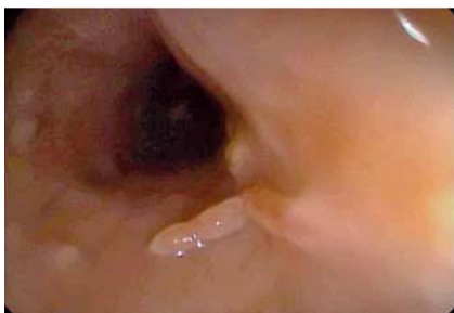
Fig. 2 Case of fibrovascular polyp of the esophagus with two polyps.