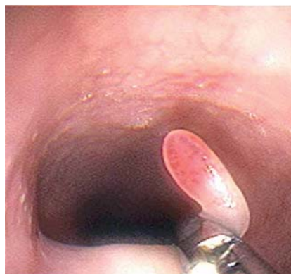
Fig. 3 Endoscopic resection of a fibrovascular polyp of the esophagus with standard forceps.

Fibrovascular polyps of the esophagus are rare benign lesions that arise from the cervical esophagus. Most of them are only diagnosed when their size induces symptoms [1].