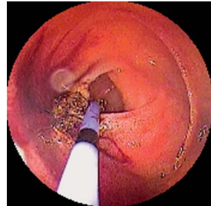
Fig. 2 Application of pulsed argon plasma coagulation (30 W) via a thin probe. A total of five applications each lasting 5 seconds were necessary to stop the bleeding.