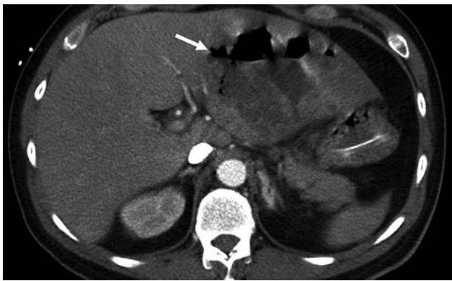
Fig. 1 Contrast-enhanced abdominal CT showed a large (11.2 cm diameter) liver abscess (arrow) in the left lateral segment of the liver with an internal air-fluid level.