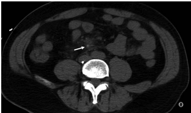
Fig. 2 Unenhanced abdominal CT demonstrated a hyperdense dot (arrow) with surrounding "dirty" fat.