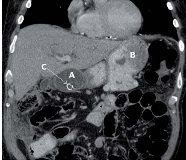
Fig. 1 Computed tomography scan reconstruction showing dilated hepaticojejunostomy loop (A), adjacent to the stomach (B), with biliary stent in situ (C).

Our case demonstrates the use of EUS in relieving biliary obstruction by drainage of an obstructed hepaticojejunostomy loop with transgastric gastroenterostomy.