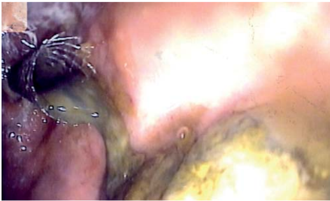
Fig. 4 Endoscopic image of the metal stent in the fundus.