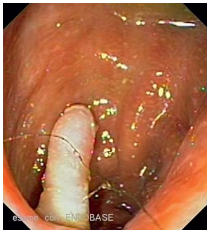
Fig. 1 Finger-like polypoid lesion of about 2 cm on the anterior wall of the rectum, with hair growth on the surface.