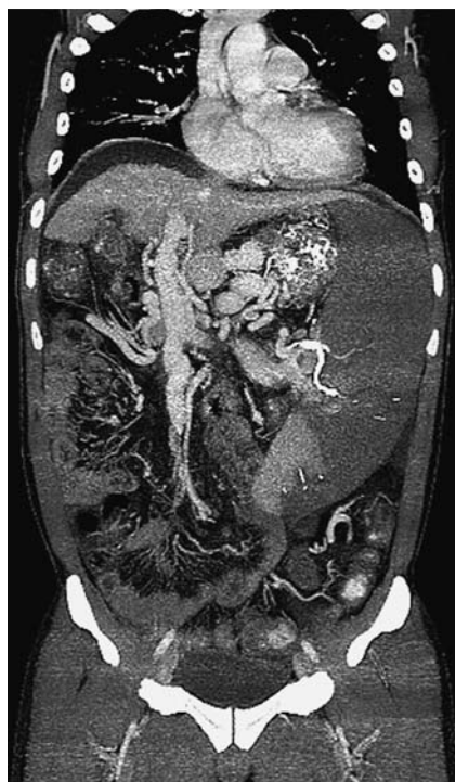
Fig. 1 Abdominal computed tomographic angiography showing multiple cyanoacrylate deposits along the splenic vein, and an enlarged spleen and unenhanced splenic parenchyma compatible with cyanoacrylate-induced splenic infarction.

A 43-year-old man with liver cirrhosis due to hepatitis B infection, who had undergone regular endoscopic variceal therapy for fundal varices, was admitted for secondary prophylaxis. The laboratory findings were unremarkable apart from a low platelet count ( 34 \times 10^3/\mu\text{L} ) and prolonged prothrombin time (17.7 s, international normalized ratio [INR] 1.46, 59%). Endoscopic examination revealed small esophageal varices and large fundal varices with the red color sign. Two injections of 2 mL of N -butyl-2-cyanoacrylate (Histoacryl; B. Braun, Tuttlingen, Germany) diluted with Lipiodol (Guerbet, Aulnay Sous Bois, France) were administered into the fundal varices. The patient had undergone multiple sessions of endoscopic injection therapy in the past with no occurrence of complications. However, 2 days after the last endoscopic cyanoacrylate therapy, he developed abdominal pain and fever, and his white blood cell (WBC) count rose to