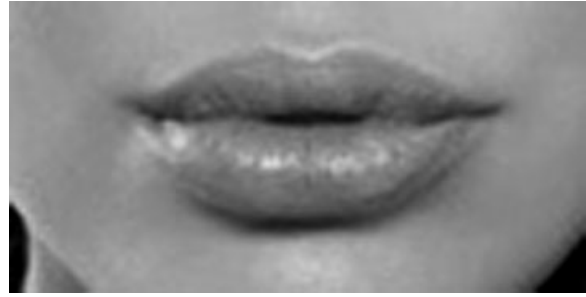
Figure 2 A photograph of a youthful lip, demonstrating fullness, slight eversion of the lower lip, visibility of the wet-dry junction of the lower lip, and preserved vertical rhytides.

Another example of a potential change in minimally invasive procedures was demonstrated in the study of the deep medial fat compartment of the cheek by Rohrich et al. 19 When saline was injected into the deep