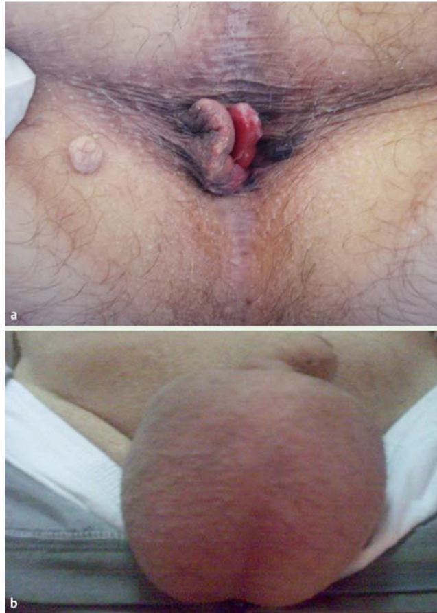
Fig. 1 Physical examination following rectosigmoidoscopy. a External hemorrhoids were visible on perianal inspection in the knee-elbow position. b Edematous scrotum.

Subcutaneous or retroperitoneal air that dissects into the dartos lining of the scrotal wall or movement of air from the intraperitoneal space into the scrotum may result in pneumoscrotum. Local gas production is another mechanism that suggests anaerobic infection, requiring urgent surgical interventions [1]. In the literature there are only seven cases of pneumoscrotum following lower gastrointestinal endoscopy [2–8]. Four of these patients had undergone polypectomy [2–5], one had undergone endoscopic mucosal resection for a tumor [6], and one with ulcerative colitis had undergone biopsy [7]. To the best of our knowledge, our case is only the second one reported in the literature involv-