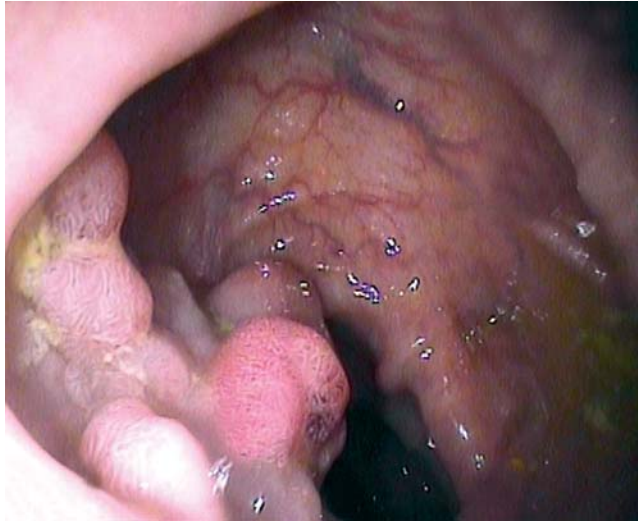
Fig. 1 Colonic polyp.