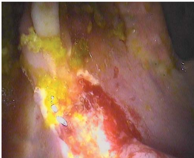
Fig. 2 Colonic polyp resection.