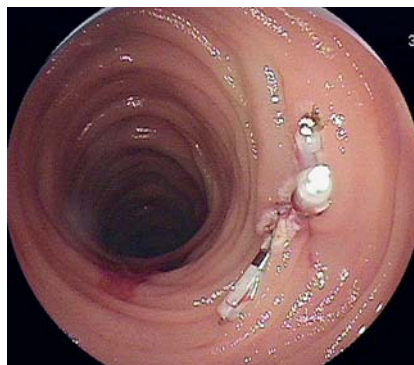
Fig. 2 Double-balloon endoscopy (DBE) showed hemostatic state after argon plasma coagulation (APC) and hemoclipping.