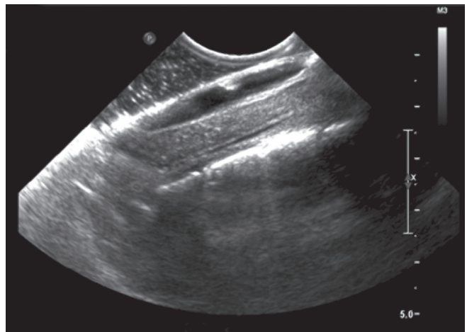
Figure 2 Intraoperative ultrasonography demonstrating the syrinx as well as the hyperechoic calcified arachnoid

A plain film of the thoracic spine revealed no abnormalities. An MRI scan revealed a thoracic syrinx at the T3