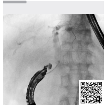
► Video 1 One-step primary endoscopic ultrasound-guided choledochoduodenostomy using a Franseen needle and an ultra-stiff, high-sliding guidewire

Endoscopic ultrasound-guided choledochoduodenostomy (EUS-CDS) using a lumen-apposing metal stent (LAMS) can be used as a primary treatment for malignant distal biliary obstruction because of its higher technical success rates and shorter procedure times than conventional transpapillary metal stent placement [1, 2]. However, it is unsuitable for minimally dilated common bile ducts (CBDs) and thin 6-mm-diameter LAMS