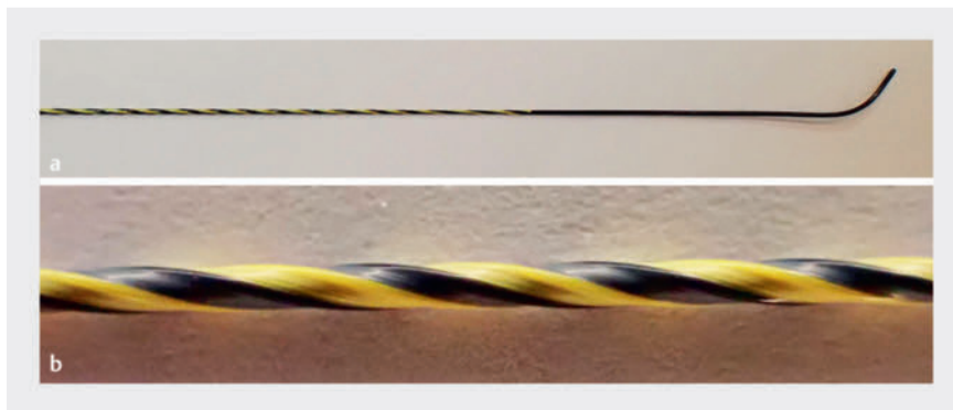
► Fig. 2 The novel guidewire measures 0.035 inches and features a thick, high-rigidity nickel-titanium core. The surface is coated with polytetrafluoroethylene, using “ridge-processing”, which reduces contact area and friction with devices, enhancing followability and insertability.