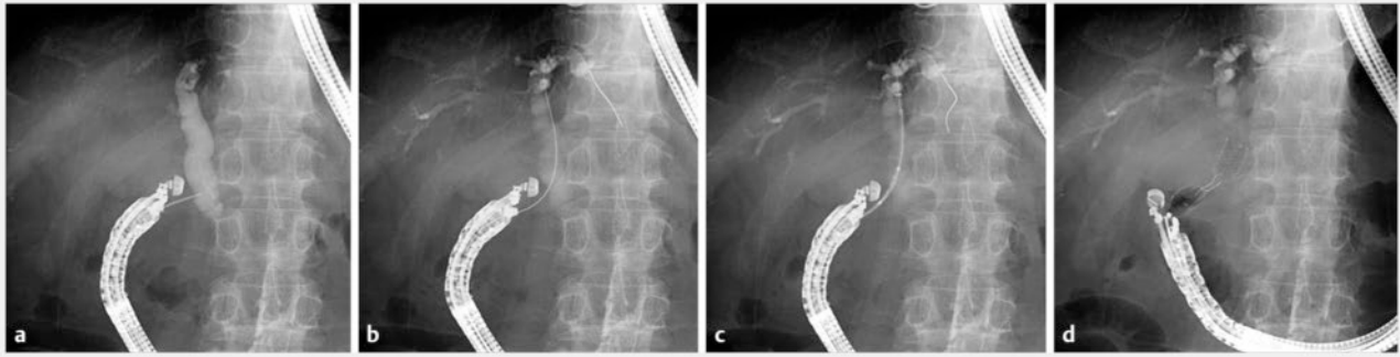
► Fig. 3 a A 19-G Franseen needle was used to puncture the common bile duct from the duodenum. b The novel guidewire was inserted into the intrahepatic bile duct. c Subsequently, the 8-Fr delivery system of the dumbbell-shaped metal stent was smoothly inserted without the need for fistula dilation. d The metal stent (12×50 mm) was then placed from the common bile duct to the duodenum.

seen needle (SonoTip TopGain; Medi-Globe, Rohrdorf, Germany), an ultra-stiff guidewire (SeekMaster Hard; Piolax Medical Devices, Kanagawa, Japan) was inserted into the intrahepatic bile duct. Subsequently, the 8-Fr delivery system of the dumbbell-shaped stent (BONASTENT M-Intraductal; Standard Sci-Tech Inc., Seoul, Korea) was smoothly inserted without fistula dilation, followed by placement of the stent from the CBD to the duodenum (► Fig. 3 , ► Video 1 ). The procedure was completed within five minutes. No adverse events or stent dysfunction, including biliary peritonitis or migration, occurred until the patient's death.