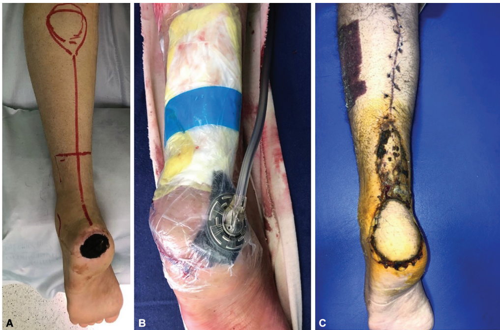
Fig. 1 (A) Patient #3: heel defect and initial drawing of the flap. (B) Patient #3: immediately postoperative, reverse sural pedicled flap with NPWT. Wet gauze in split-thickness skin graft (STSG) nonincluded in the NPWT. (C) Patient #3: postoperative integration of the flap at 6 weeks. NPWT, negative pressure wound therapy.

For over 20 years NPWT has been an ally in surgical reconstruction of skin and soft tissue defects. It has proven beneficial in decreasing risk of infection, reducing the number of dressing changes, and allowing faster healing. In animal models, NPWT leads to an increase in granulation tissue formation, blood flow velocity, and capillary caliber as early as 3 days after its use. In addition, it minimizes edema (which allows improvement in oxygen transportation). Following 5 days of NPWT use, there is evidence of fibroblast conversion to fibrocytes, which increases the quality and quantity of the extracellular matrix. 3 This is the reason we