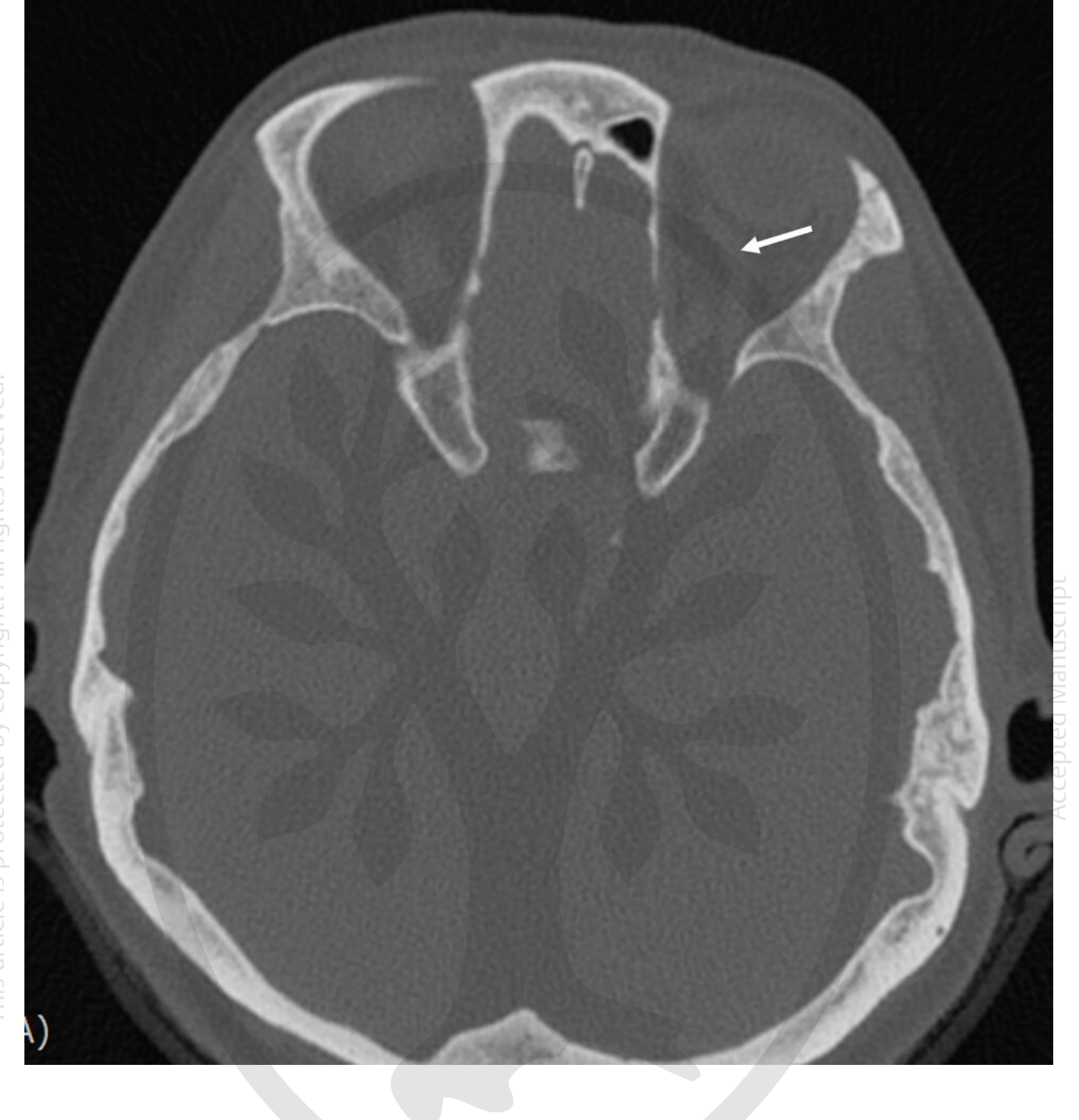
is article is protected by copyright. All rights reserved.