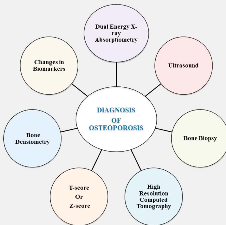
► Fig. 1 Advanced technologies for fracture and osteoporosis detection.