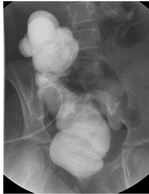
Fig. 2 Contrast enema showing a dilated right colon without an anastomotic stricture.

One year later, the patient returned to our clinic with recurrent symptoms of constipation. She began taking 30 mg of senna daily. Rescuing of the neo-Malone site was attempted but could not be found so a cecostomy tube was placed instead. The patient commenced antegrade flushes. Accumulation of stool in the right colon was also noted in an updated contrast enema (→ Fig. 2).