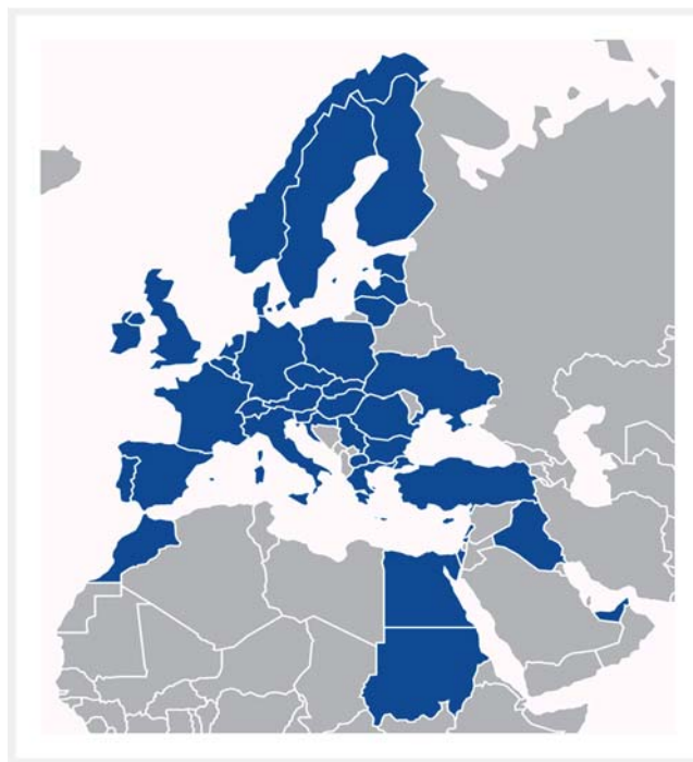
► Fig. 1 ESGE member societies spanning Europe and beyond.

In 2007, an “individual” ESGE membership program was launched and, since 2008, ESGE also offers “dual membership”