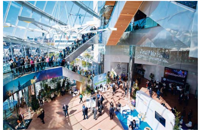
► Fig. 3 ESGE Days 2023 held at the Dublin Convention Centre.