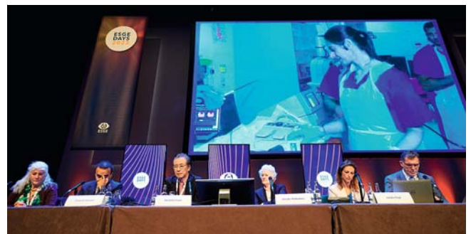
► Fig. 4 Live demonstrations of endoscopy, an invaluable learning opportunity at ESGE Days.

to all ESGE member societies and their members. More recently, in 2022, as a further sign of its growth and maturity, ESGE established the honorary designation “Fellow” of ESGE (FESGE). FESGE is an honorary title bestowed upon an individual by the ESGE in recognition of significant professional achievement and superior competence within the field of gastrointestinal endoscopy through research, professional service, education, and/or clinical care.