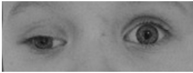
Fig. 1 Patient 1 week after stroke: the picture shows the ipsilateral oculomotor nerve palsy on the right (gaze down and out, dilated pupil).

for 5 days. Due to delayed improvement immunoglobulins (2 g/kg over 2 days) were administered secondly because of the possibility of Bickerstaff encephalitis. When steroids and immunoglobulins failed to produce a therapeutic breakthrough and MRI on day 10 showed demarcation in mid-brain, we considered it to be occlusion of the small arteries. The patient subsequently received acetylsalicylic acid (ASA) for secondary stroke prophylaxis. The initial diagnostic tests did not show any anomalies, apart from detectable oligoclonal bands in the cerebrospinal fluid. Subsequent genetic testing revealed the cause. Single exome sequencing identified two compound heterozygous variants in the ADA2 gene: the likely pathogenic variant c.158del, p.(Asn53Thrfs*12) based on the American College of Medical Genetics and Genomics criteria 13 and the variant of unknown significance (VUS) variant c.2T>A, p.(0?). Compound heterozygosity could be determined from single exome sequencing due to the close proximity of the variants (► Supplementary Fig. S1 , available in the online version only). The extended diagnostic workup revealed a severe deficiency of plasma ADA2 enzyme activity of 0.0 mU/g protein, as measured in extracts of dried plasma spots as described in Ben-Ami et al. 14 The patient also