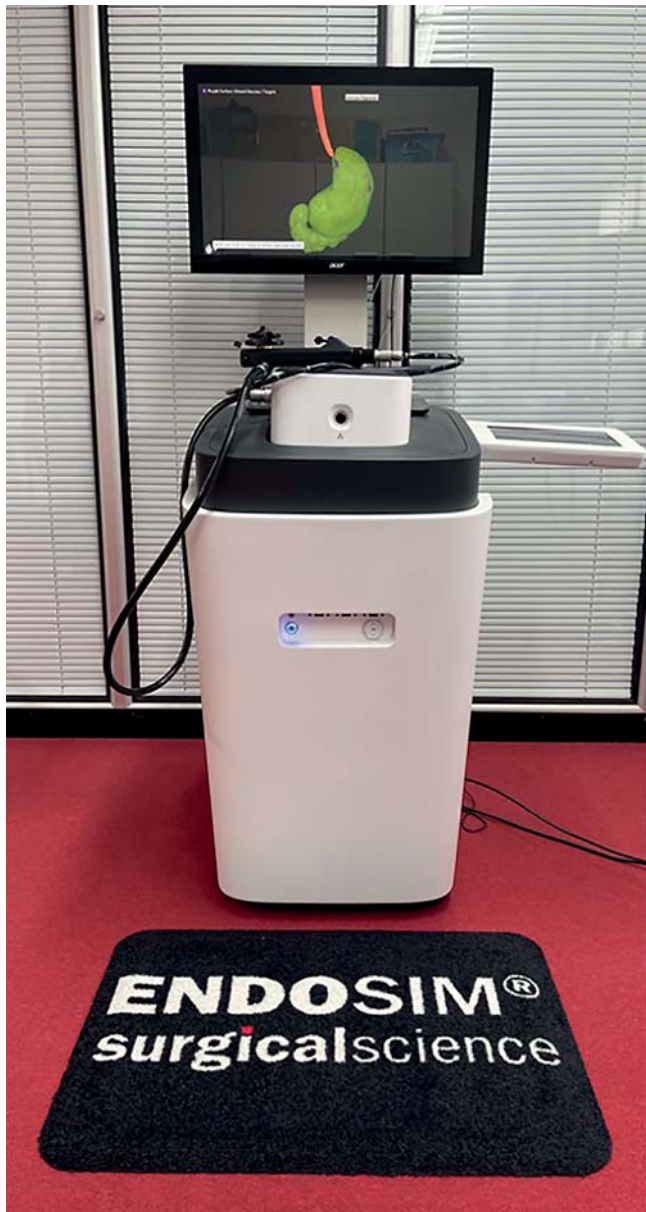
► Fig. 1 A Simcart, table-mounted, height-adjustable EndoSim Virtual Reality (VR) endoscopy simulator with integrated haptic technology. (EndoSim: Surgical Science Sweden AB).