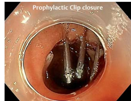
► Fig. 3 Prophylactic clip closure.

Large laterally spreading tumors (LSTs) of the duodenum are considered by most experts to be very challenging benign lesions requiring endoscopic resection. Piecemeal endoscopic mucosal resection (EMR) is the gold standard but leads to a high recurrence rate and a risk of delayed bleeding.