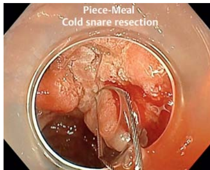
► Fig. 2 Piecemeal cold snare resection of the laterally spreading tumor.