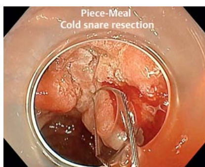
► Fig. 2 Piece-meal cold snare resection of the laterally spreading tumor.