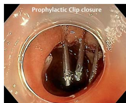
► Fig. 3 Prophylactic clip closure.

Large laterally spreading tumors (LSTs) of the duodenum are considered by most experts to be very challenging benign lesions requiring endoscopic resection. Piecemeal endoscopic mucosal resection (EMR) is the gold standard but leads to a high recurrence rate and a risk of delayed bleeding.