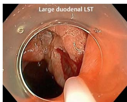
► Fig. 1 Large duodenal laterally spreading tumor.