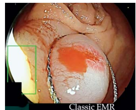
▶ Fig. 2 Endoscopic mucosal resection of the angiodysplasia.