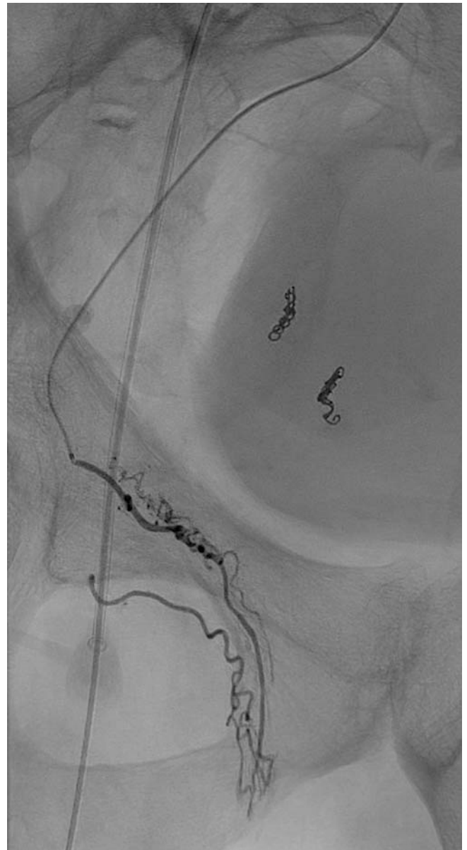
► Fig. 3 Forced contrast injection into the right anterior terminal branch of the superior rectal artery. Retrograde display of a feeder vessel from the medial rectal artery to the hemorrhoidal plexus.

Zakarchenko treated 40 patients with grade one to three hemorrhoids [26]. Additional particles were also used for emboli-