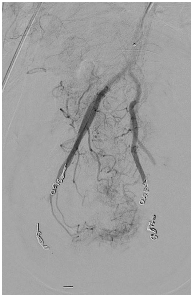
► Fig. 4 Final angiogram. Complete stasis in the distal terminal branches of the superior rectal artery that feed the hemorrhoidal plexus.

ment and improved quality of life in 87.5 % of patients. Complications were not observed within the follow-up period of 12 months [27].