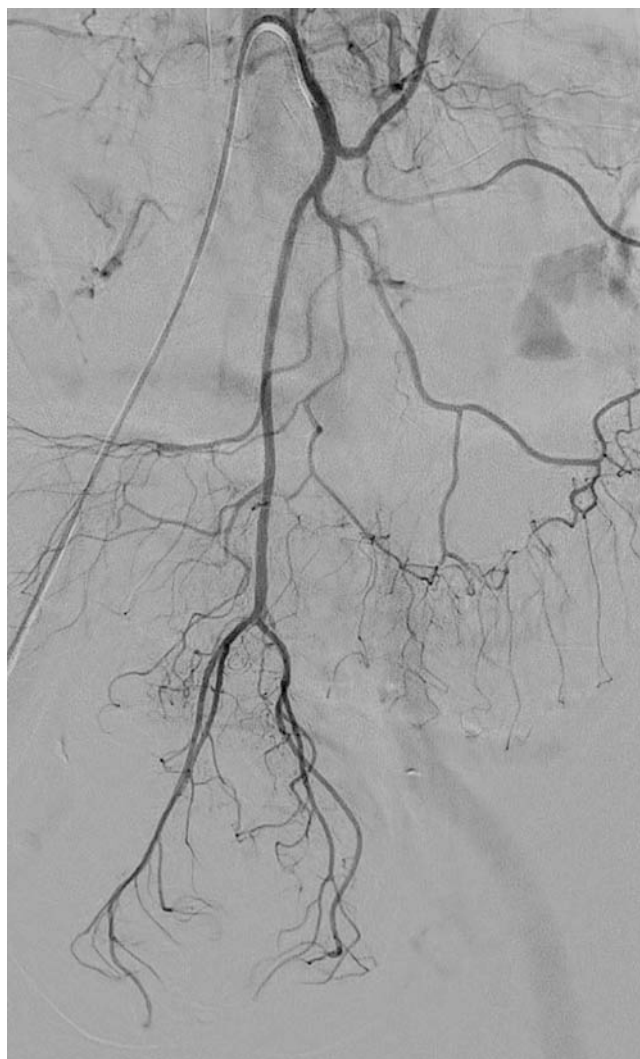
► Fig. 1 Digital subtraction angiography of the inferior mesenteric artery. The terminal branches of the superior rectal artery are visualized at the bottom of the image. Due to the large size of the depicted inferior mesenteric artery, deep intubation with a 4F catheter is possible without risk.

Fourteen patients with grade two to four hemorrhoids, with half of the patients having previously undergone surgery and ten having been treated with anticoagulants or having hypocoagulation due to liver cirrhosis, were treated in a further study by Vidal et al. [23]. A temporary, painful perianal reaction occurred in one case. In this first study, incomplete embolization was initially performed. To avoid ischemic complications, only two of the four terminal branches of the superior rectal artery were occluded in the first six patients. Due to rebleeding, complete embolization was performed in further sessions in four patients. In total, clinical improvement was seen after one month in 72 % of patients. Patients with contraindications for surgical treatment and patients with persistent symptoms in spite of prior surgery were treated in another study by Vidal's working group. Primarily grade