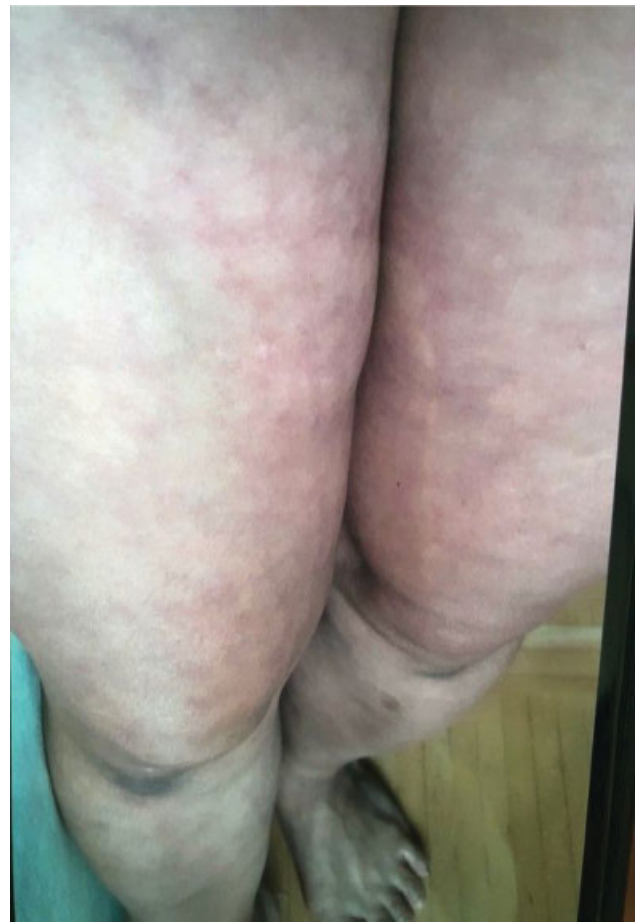
Fig. 2 Clinical image of livedo reticularis. Representative photograph of the lower extremities in a 49-year-old female patient. Livedo reticularis occurred 3 days after the patient developed respiratory symptoms. (Courtesy of Wolfram Hoetzenecker and Isabella Pospischil, Department of Dermatology, Kepler University Hospital, Johannes Kepler University, Linz, Austria).

Livedo reticularis, also called cutis marmorata , results from constriction of cutaneous central arterioles and slowed arteriolar blood flow with subsequent dilatation of venules in the skin and desaturation of the blood, 87,88 thus forming a regular purple or bluish net-like pattern with complete rings and a pale center (–Fig. 2). 87,89 It may be transient or persistent and may physiologically be found in children and young to middle-age women 90 as a result of vasoconstriction of cutaneous vessels (e.g., cold-induced). 87 In COVID-19, the transient livedo pattern has been associated with mild to moderate disease, and may be unilateral or symmetrical often leaving out the trunk. 87,91 Coagulation parameters are usually normal which supports the theory of endotheliitis caused by direct viral uptake into endothelial cells and vascular smooth muscle cells leading to vasoconstriction. 22,91,92