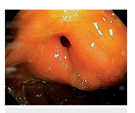
► Fig. 1 Ileocolonic anastomotic stricture.