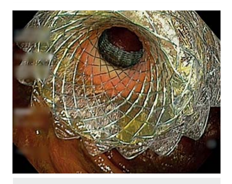
▶ Fig. 3 SPAXUS stent (Taewoong Medical, Gyeonggi-do, South Korea) set in the ileocolic anastomotic stricture. The whitening of the mucosa reflects the dilation of the stricture by the prosthesis.