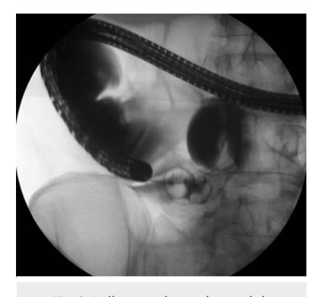
► Fig. 2 Balloon probe set beyond the stricture confirming the short nature of the stricture.