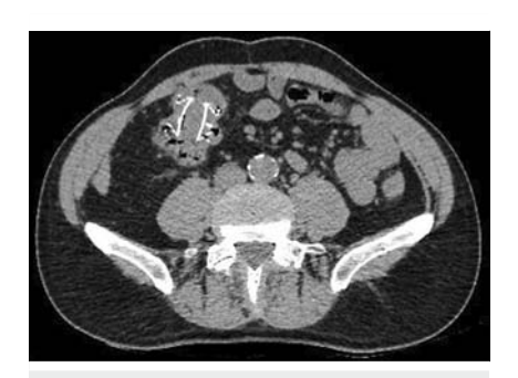
➤ Fig. 4 A week after the procedure, a computed tomography scan was performed to investigate rectal bleeding (which happened to be proctologic) and confirmed the correct position of the SPAXUS stent.