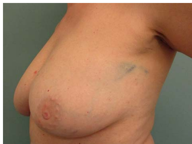
► Fig. 2 Permanent undesirable skin tattooing after carbon marking of the TLN.

After the PST additional marking of the TLN immediately before surgery is not necessary. After incising the skin and opening the axillary fascia, the grey to black marked perinodal tissue and the TLN are sought purely visually and removed (► Fig. 3 ). In patients with body tattoos on the upper body, detection of the iatrogenically tattooed lymph node can be more difficult if other lymph nodes are pigmented as a result of the cosmetic skin tattoo. A distinction is usually possible, however, as the perinodal tissue is pigmented only after TLN, so that a body tattoo is not an absolute contraindication to TLNB after carbon marking (► Fig. 4 ).