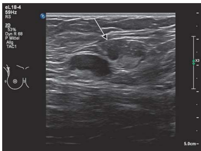
► Fig. 1 Hyperechoic carbon particles in the TLN (arrow) after tattooing. Immediately to the left of this, a further hypoechoic suspicious non-tattooed lymph node is visible.