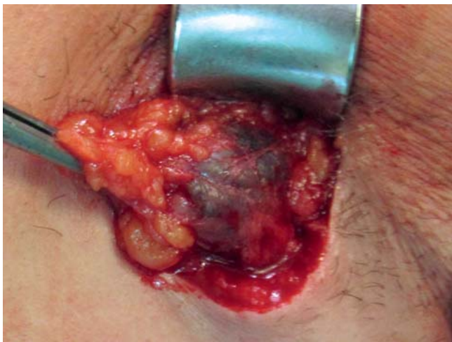
► Fig. 4 Pigmented axillary SLN after cosmetic tattoo on the upper arm. (The perinodal tissue is not pigmented, unlike TLNB after iatrogenic lymph node tattooing.)

at least one tattooed lymph node was found at operation. The concordance rate of SLN and tattooed lymph nodes was 75.7%, and the FNR was not obtained as ALND was performed in only 24 subjects. The authors report that small foci of pigment deposits were visible in other lymph nodes on microscopy in 45% of the patients in the study in addition to the macroscopically visible tattooed lymph nodes. It must therefore be assumed that a certain migration of the carbon solution into other lymph nodes can take place. Microscopic detection of pigment alone (i.e., not visible with the naked eye) can therefore not be regarded as evidence of successful removal of the TLN [20]. The prospective study by Patel et al. included the 12 patients from the pilot study by Choy et al. referred to above [17] in addition to the 47 patients who received