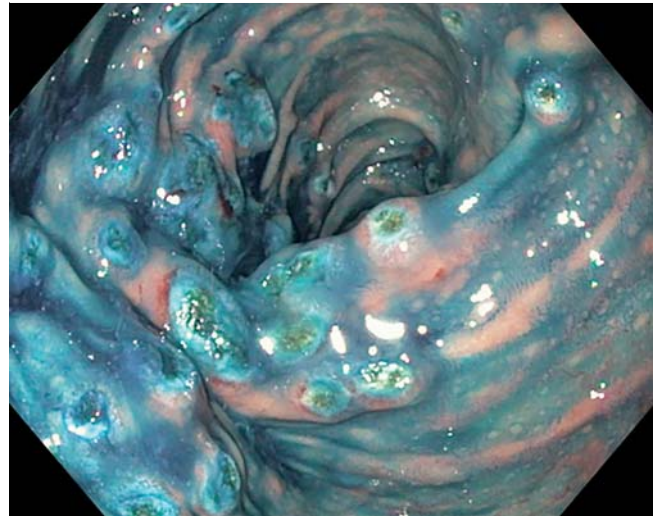
► Fig. 3 Rectal aspect after APC treatment of numerous polyps.