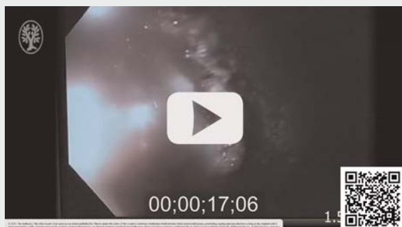
► Video 1 Endoscopic application of SPTP to a spurting bleed listed as Bleed #2 followed by application of SPTP to a high flowrate arterial bleed listed as Bleed #9. Videos are sped up 1.5×.

in 4.3 \pm 1.2 minutes with 1.8 \pm 0.3 g of powder. The dose of thrombin applied was slightly more in the Forrest 1A bleeds, with 1990 \pm 850 NIH units delivered compared to 720 \pm 90 NIH units delivered in Forrest 1B bleeds.