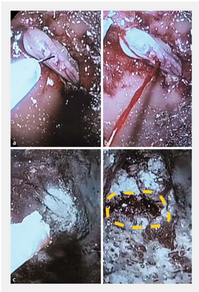
► Fig. 2 Representative endoscopy photos showing how bleeding was initiated, SPTP applied and bleeding stopped. a Identification of the gastroepiploic AV bundle in the stomach lumen and puncture with an endoscopic needle knife. b Initiation and classification of pulsatile Forrest Class 1A bleed. c Application of SPTP ad libitum via catheter, and significantly reduced bleeding 1 min post-application. d Robust hemostasis 3.8 min post-application, which persisted until sacrifice.