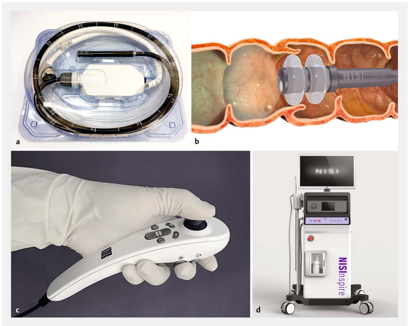
► Fig. 1 The NISInspire-C System. a NISInspire-C colonoscope. b Inflated twin balloons. c Hand controller. d The NISInspire-C console.

The demographics characteristics of the subjects are summarized in ► Table 1 . Fourteen subjects were male (73.7%) and five were female (26.3%). All subjects were Chinese with a mean age of 55.4 years (range: 40–69; SD: 8.5 years). Mean body weight and body mass index were 64.0 kg (range: 43.0–87.7; SD: 11.5 kg) and 23.5 kg/m 2 (range: 17–33; SD: 3.7 kg/m 2 ), respectively. All subjects received monitored anesthesia care. There were seven (36.9%), nine (47.4%) and three (15.8%) subjects with BBPS 8–9, BBPS 6–7 and BBPS 3–5, respectively.