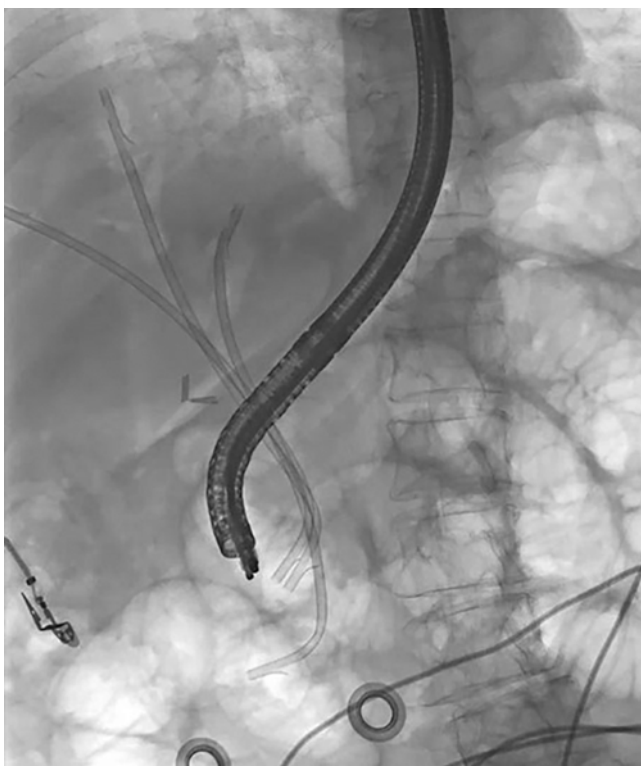
► Fig. 1 Fluoroscopy during ERC showing a biliary plastic stent perforated through the duodenal wall.

SMDP, stent migration-induced duodenal perforation; OTSC, over-the-scope clip; CT, computed tomography.