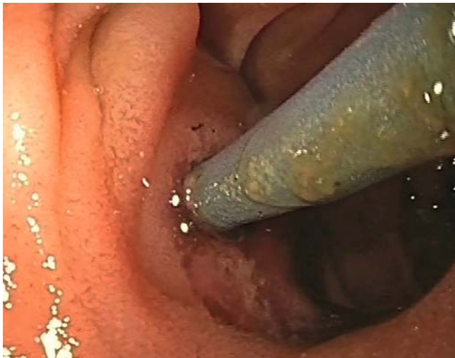
► Fig. 3 Endoscopic view of a perforated biliary plastic stent through the duodenal wall.