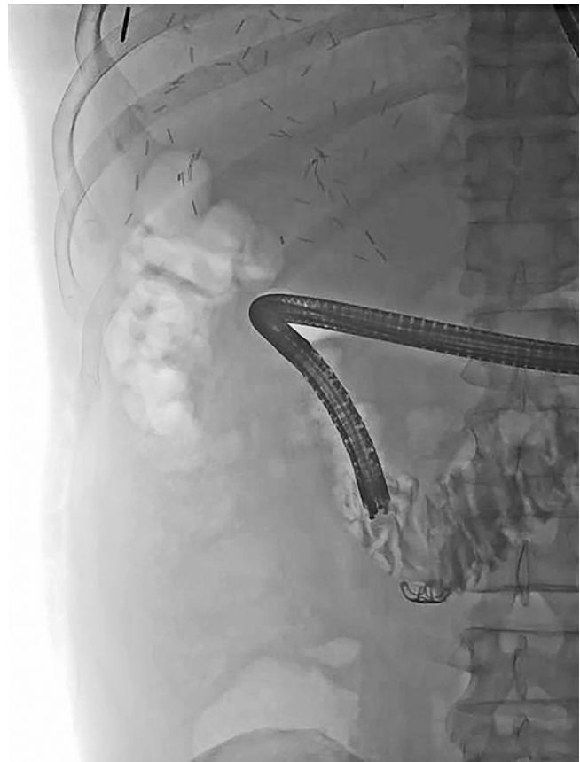
► Fig. 4 Fluoroscopy during ERC showing no contrast leakage after placement of the OTSC.

To the best of our knowledge, this is the first study to report on the actual prevalence rate of SMDP in a large consecutive cohort of patients that undergo ERC. Previous publications only comprise case reports [4–30]. Prevalence rates in our study may seem high, however, SMDP may well be an underreported complication, due to hesitation of physicians to report a complication that may be (falsely) attributed to inadequate technical skills. The results of our study show that SMDP indeed is erroneously considered a rare complication of ERC and occurs also in expert ERC centers when experienced endoscopists performed the procedure. Our results provide for the first time a plausible estimate of the actual complication rate of SMDP. Since the risk of SMDP in our study for patients with a perihilar stricture is of the same magnitude as the risk of post-ERCP pancreatitis (3.5%–9.7%) and bleeding (0.3%–9.6%) [32], we propose to include the risk of SMDP in the informed consent procedure for patients undergoing an ERC for a perihilar stricture.