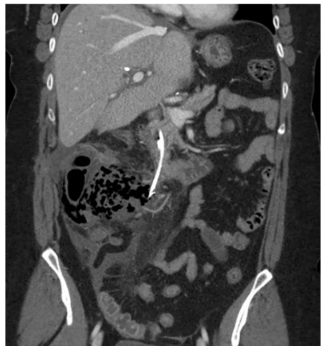
► Fig. 2 CT scan showing a biliary plastic stent perforated through the duodenal wall.