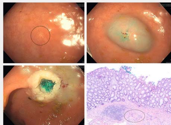
► Fig. 2 Top left: Healthy-appearing scar after initial resection. Top right: Saline lift for EMR of the scar. Bottom left: EMR resection site. Bottom right: Histopathology showing residual carcinoid tissue.

EUS, endoscopic ultrasound; EMR, endoscopic mucosal resection; ESD, endoscopic submucosal dissection; APC, argon plasma coagulation.