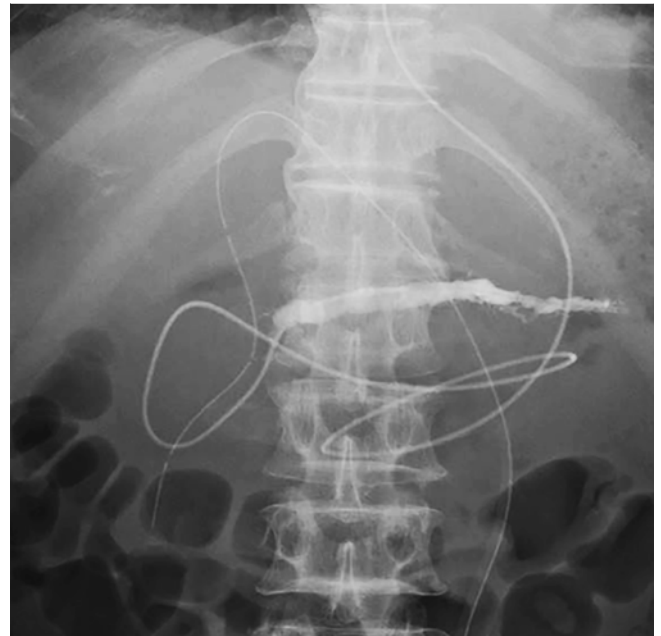
► Fig. 4 Pancreatography through the nasopancreatic drainage tube on Day 10 after treatment showing resolution of pancreatic duct dilation and repair of duct disruption.

in two, and Enterobacter cloacae , Streptococcus constellatus , Enterococcus faecalis , and Stenotrophomonas maltophilia in one patient each.