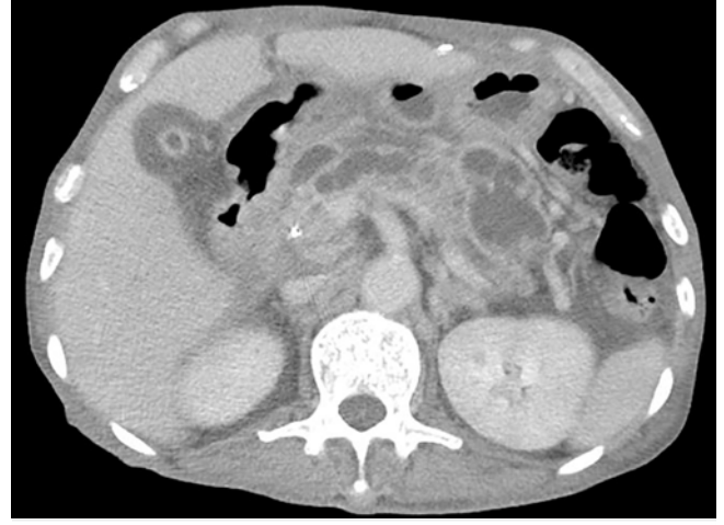
► Fig. 2 Abdominal CT at the time of the diagnosis of pancreatic cancer showing a dilated main pancreatic duct (arrow) and tumor (arrowhead) near the pancreas head.