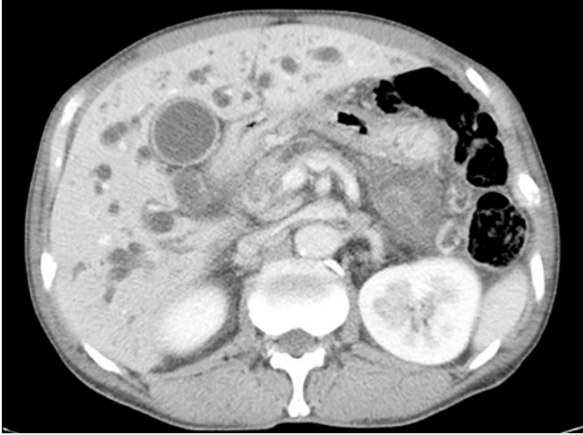
► Fig. 1 Abdominal CT on admission showing a dilated main pancreatic duct (arrow) that was larger than at diagnosis of pancreatic cancer.