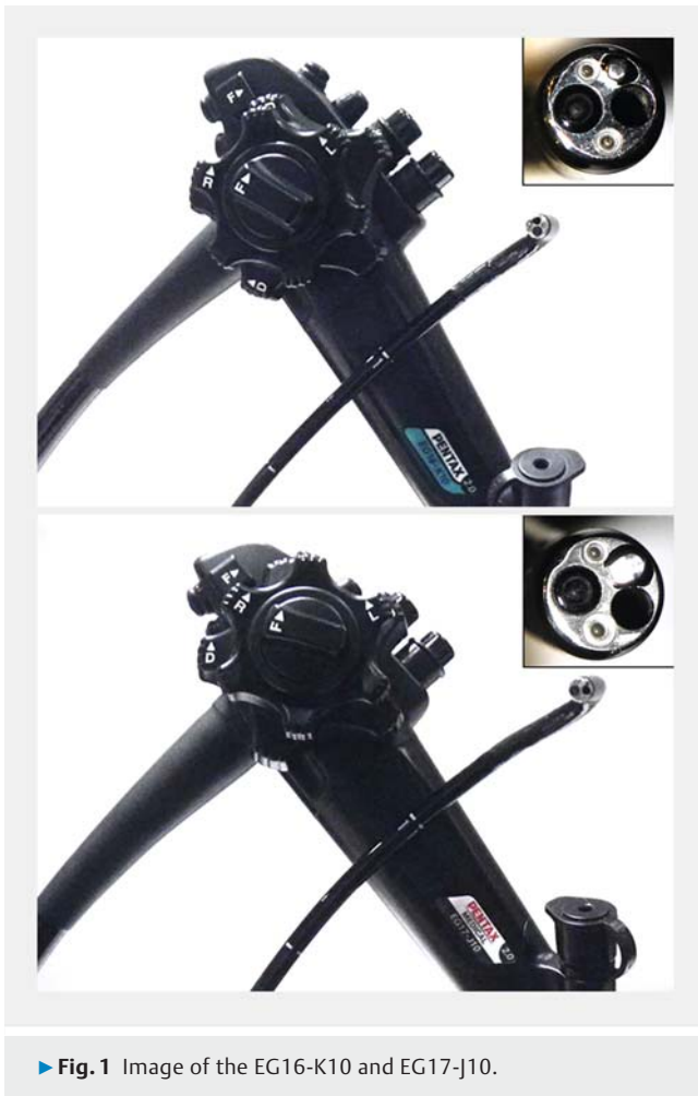
► Fig. 1 Image of the EG16-K10 and EG17-J10.

result, examination time using ultrathin scopes is longer than with conventional scopes. In a previous study, a flexible ultrathin scope was found to reduce patient discomfort during the examination but significantly lengthened the examination time [12]. From the standpoint of time efficiency, a longer ex-