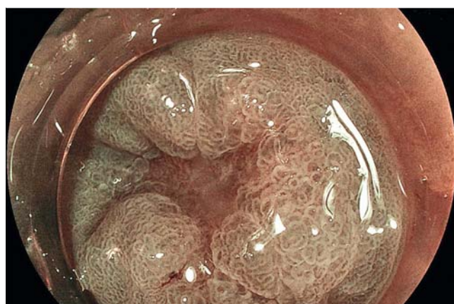
► Fig. 2 Virtual chromoendoscopy with BLI (Blue Laser Imaging, Fujifilm Co., Japan).

lesions in eight patients (10.2%). Clinicopathological characteristics of the patients are shown in ► Table 1 . ► Fig. 1 , ► Fig. 2 , ► Fig. 3 , ► Fig. 4 , ► Fig. 5 , and ► Fig. 6 are illustrative of use of teardrop sodium hyaluronate solution for SM injection in a patient with superficial gastric neoplasm.