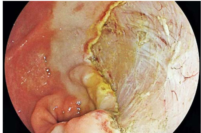
► Fig. 5 Complete tumor resection was achieved en-bloc without injury to muscularis propria.