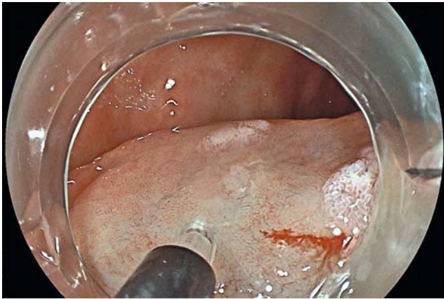
► Fig. 3 After placement of markings submucosal injection was performed with teardrop solution with 0.4% sodium hyaluronate showing an effective lifting.