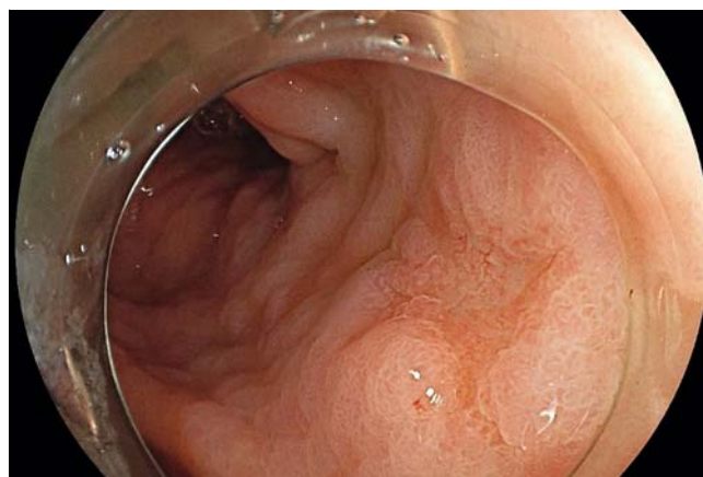
► Fig. 1 A depressed-type lesion (0IIc) in the antrum.

The mean duration of the procedure was 105.3 minutes (SD: ± 51.6 minutes) Histology of resected specimens revealed low-grade intraepithelial neoplasia: 12 patients (15.3%); high-grade intraepithelial neoplasia: 22 patients (28.3%); adenocarcinoma: 29 cases (37.2%); neuroendocrine tumors (NET): two patients (2.5%); polypoid lesions: five patients (6.4%) and subepithelial