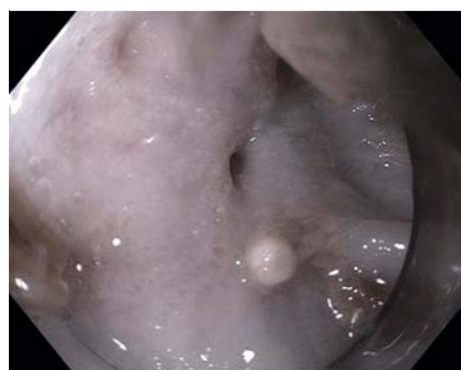
►Fig. 1 Endoscopic image showing severe esophageal stenosis at 34 cm from the incisors.