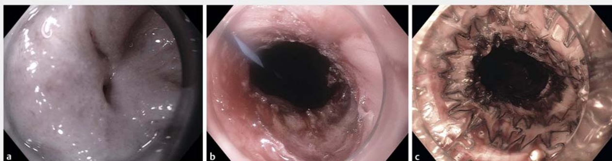
► Fig. 3 Endoscopic images showing: a the esophageal stricture following submucosal injection of methylene blue and normal saline solution in a four-quadrant fashion; b the stricture following incision in the four quadrants; c the fully covered esophageal stent in position following stricturotomy.