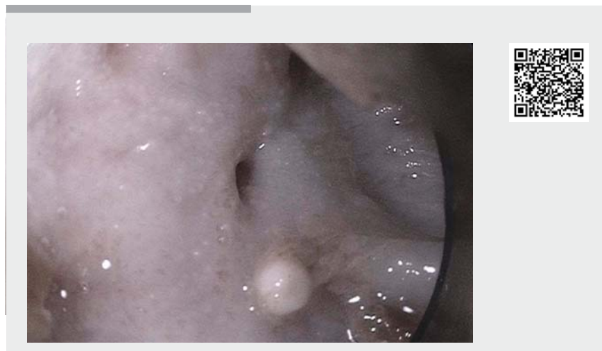
►Video 1 Endoscopic stricturotomy using an electrocautery technique for a refractory complex distal esophageal stricture.

On repeat endoscopy (►Video 1), a severe stenosis was noted at 34 cm from the incisors (►Fig. 1), measuring 1 mm in diameter and 4 cm in length (►Fig. 2). A submucosal injection of methylene blue and saline solution proximal to the stricture was used to create a cushion to perform the stricturotomy (►Fig. 3 a). The stenosis was first carefully incised with a dissection knife, initially the IT2 (Olympus, Tokyo, Japan) and then the DualKnife (Olympus, Tokyo, Japan), using a combination of Endocut Q and forced coagulation. A guidewire was passed through the pinhole opening, delineating the esophageal lumen. We continued to incise the fibrotic tissue of the stenosis carefully in layers, until it was possible to pass the gastroscopethrough it (►Fig. 3 b). Contrast injection revealed no leakage and improved passage of the contrast into the gastric body. To allow for esophageal remodeling, the distal esophagus was then stented with a 23 × 100-mm EndoMAXX fully covered stent (►Fig. 3 c). The procedure was technical-