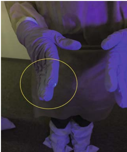
► Fig. 3 The dye was identified on the gloves of the nurse when the modified surgical mask was not used.