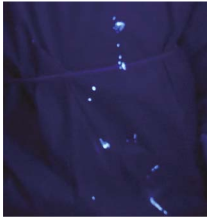
► Fig. 5 Minimal contamination of the endoscopist by scattered dye droplets, visualized using ultraviolet light, when the modified surgical mask was used.