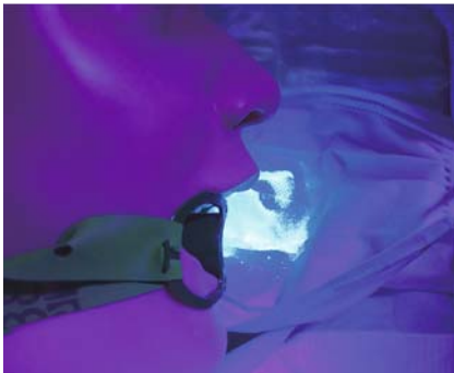
► Fig. 4 Excessive amounts of dye were found inside the modified surgical mask when worn by the “patient.”

sive amounts of dye were found inside the mask (► Fig. 4 ). There was no contamination of the floor, and only a minimum amount of dye was found on the endoscopist's upper chest and abdomen (► Fig. 5 ). No dye was found on the nurse. In summary, upper gastrointestinal endoscopy could be performed on a “patient” wearing a modified surgical mask. This method can substantially reduce contamination by splash and aerosol droplets produced by patients during endoscopy, and is simple and cost-effective.