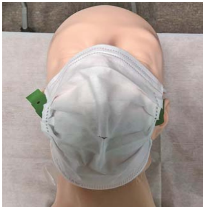
► Fig. 1 The modified surgical mask.

Coronavirus disease (COVID-19) transmission occurs primarily through direct contact or air droplets [1,2], and endoscopic procedures are high risk. In this era of “with COVID-19,” establishing simple infection prevention measures within an endoscopy department to protect both patients and personnel is strongly recommended. Hence, we proposed a simple method using a modified surgical mask. We made a hole (10 mm diameter) in the center of a surgical mask (► Fig. 1 ). Next, simulated endoscopy was performed with and without the modified surgical mask using a mannequin with the mouthpiece in place (► Video 1 ).