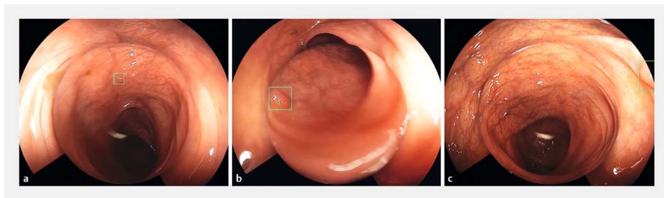
► Fig. 2 a Computer-assisted detection of a diminutive polyp (rectangle) in the forward field seen with the EWAVC. b Computer-assisted detection of a 5-mm polyp (rectangle) in the forward field seen with the EWAVC. c Computer-assisted detection of a 4-mm polyp (rectangle) behind a fold in the lateral-backward field seen with the EWAVC.