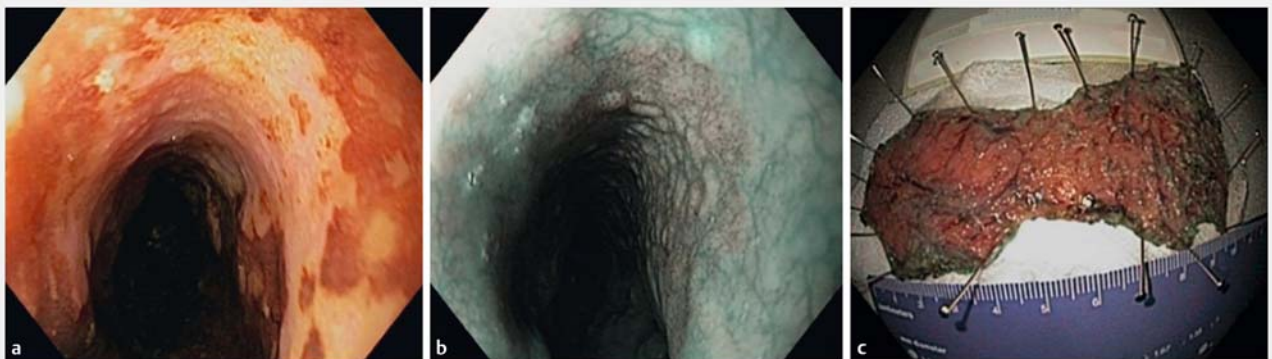
► Fig. 3 Esophageal lesion with lugol chromoendoscopy on the left (iodine-unstained area) and NBI in the middle (brown). Stretched resected specimen on the right.

The median time of follow-up was 13 months (0–154). Local recurrence rate was 3% ( n = 4 ) after a median time of follow-up of 16 months (1–17).