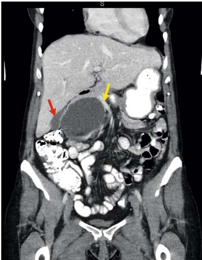
► Fig. 1 Coronal abdominal CT showing a 7.7 cm × 6.7-cm cystic pancreatic head lesion displacing the gallbladder (red arrow) portal and superior mesenteric veins (yellow arrow).