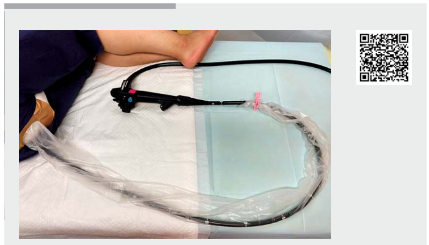
► Video 1 New precautionary technique using an echo probe cover to prevent oral–fecal transmission of SARS-CoV-2 during emergency colonoscopies.

viral transmission, as well as reducing endoscopists' mental stress by providing protection against contamination.