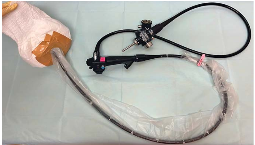
► Fig. 1 Overview of the new precautionary technique using the echo probe cover.

Enclosing the endoscope within the probe cover helps to block aerosols and the diaper absorbs any droplets. These materials can be disposed of without scattering the virus into the surroundings. This method can effectively prevent