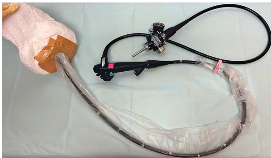
► Fig. 1 Overview of the new precautionary technique using the echo probe cover.

Enclosing the endoscope within the probe cover helps to block aerosols and the diaper absorbs any droplets. These materials can be disposed of without scattering the virus into the surroundings. This method can effectively prevent