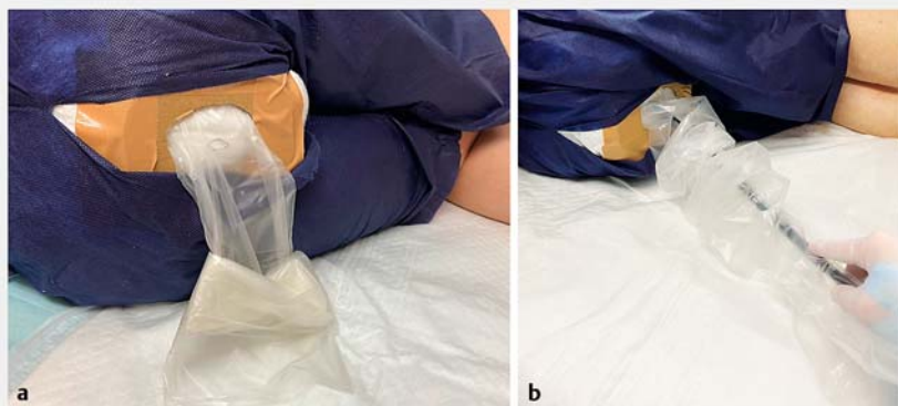
► Fig. 3 The completed shield. a The cardboard is taped to a prepared 4-cm hole in the diaper. b This method does not interfere with scope maneuvers during colonoscopy.