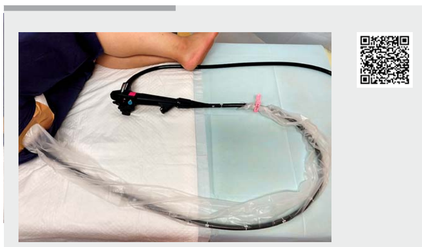
► Video 1 New precautionary technique using an echo probe cover to prevent oral–fecal transmission of SARS–CoV–2 during emergency colonoscopies.

viral transmission, as well as reducing endoscopists' mental stress by providing protection against contamination.