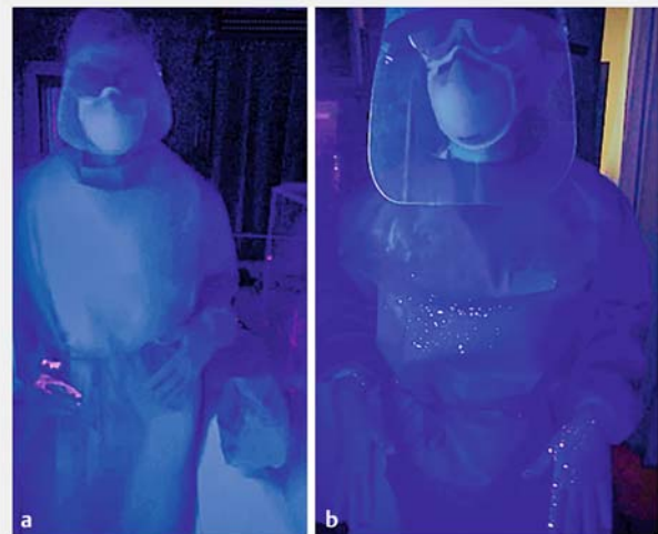
► Fig. 6 Air droplet dispersion in a simulated cough during endoscopy with the Endoprotector. a Endoscopist. b Nurse (with "open doors" in Face B).

We describe an easily and affordably manufactured barrier that may help protect clinicians during upper endoscopy procedures. To the best of the authors' knowledge, only one other "aerosol box" has been developed, specifically for use during endotracheal intubation [9]. Acrylic plastic was chosen due to its ease of shaping, cleaning, and maintenance. A prototype cardboard box was first created to adjust the box measurements and test the feasibility (possible restriction of hand movement during the procedure) and the practicality of its use (box disinfection and storage). The protective effect of the Endoprotector was confirmed in the simulation test, for both endoscopists and nurses. The box was tested in patients with-