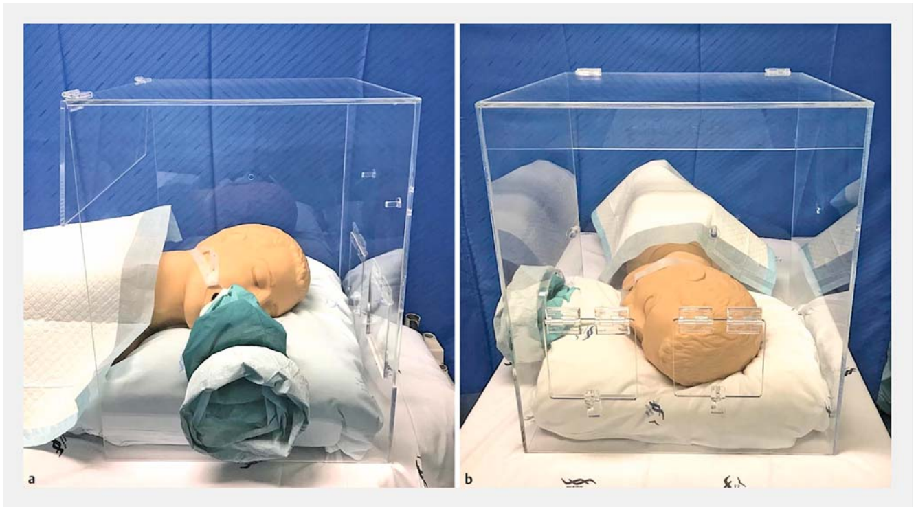
► Fig. 3 The Endoprotector acrylic endoscopic box. a Face A. b Face B.