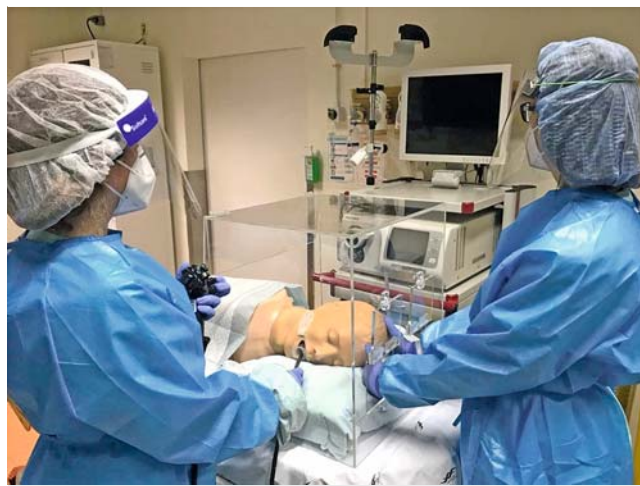
► Fig. 2 General view of the Endoprotector acrylic endoscopic box.

and unrecognized exposure of the endoscopist's face to potentially infectious biologic samples during endoscopy.