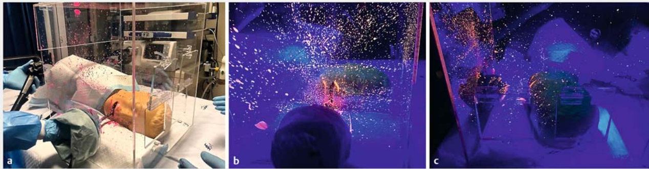
► Fig. 5 Air droplet dispersion in a simulated cough during endoscopy with the Endoprotector. a General view under white light. b Face A under UV light. c Face B under UV light.