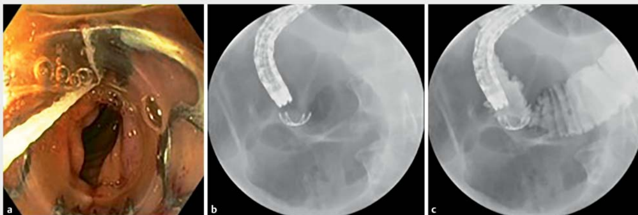
► Fig. 2 Radiologic and endoscopic pictures from patient 2. a Over-the-scope-clip mounted on the tip of the scope before application; b Fluoroscopic image obtained right after placement of OTSC. c Contrast injection showing no leak after the application of OTSC