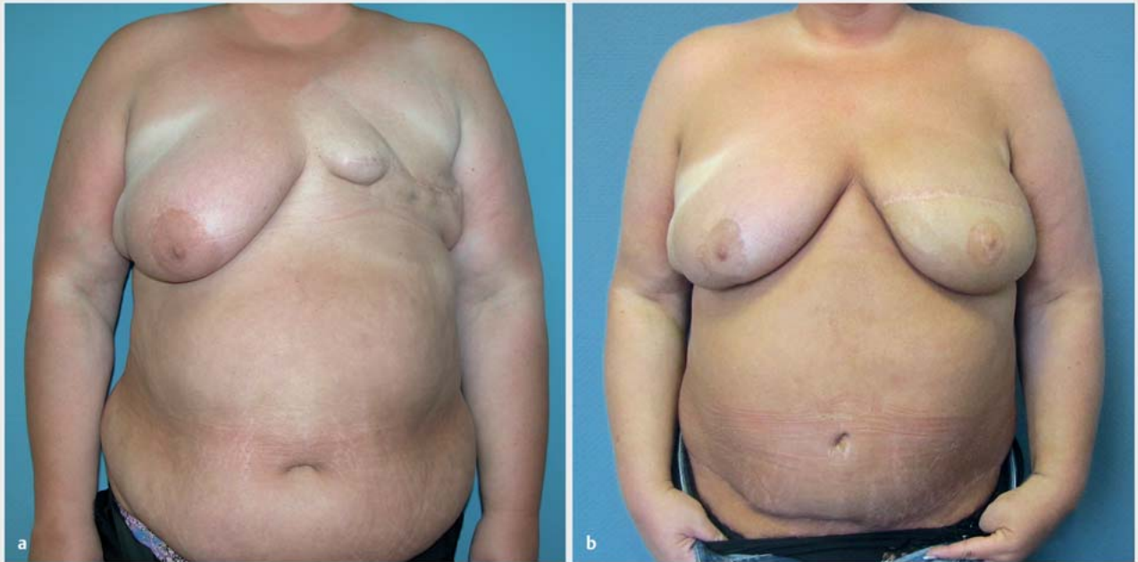
► Fig. 2 a Preoperative findings. Patient aged 44 years, status post left-sided mastectomy. b Postoperative outcome. Patient outcome 49 months after left-sided DIEP flap reconstruction.