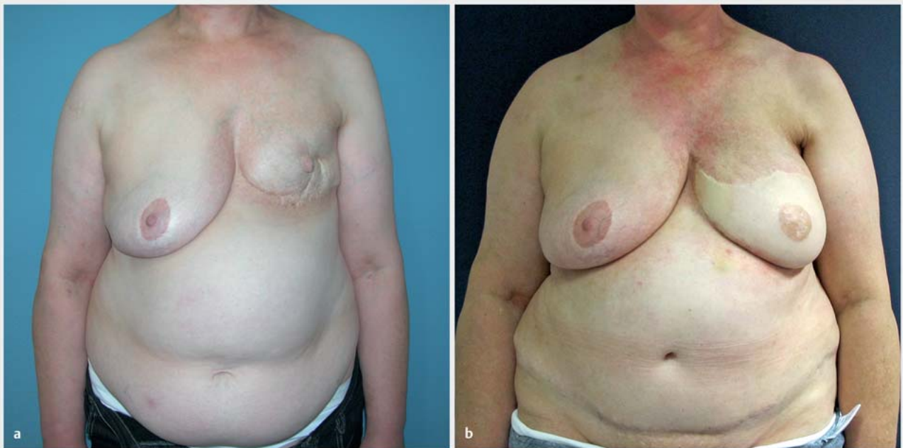
► Fig. 3 a Preoperative findings. Patient aged 52 years, status post left-sided BCT. b Postoperative outcome. Patient outcome 47 months after skin-sparing mastectomy and left-sided DIEP flap reconstruction.

In our study, the group of patients who had had radiation therapy of the affected chest wall preoperatively did not have a significantly higher risk of intra- and postoperative complications com-