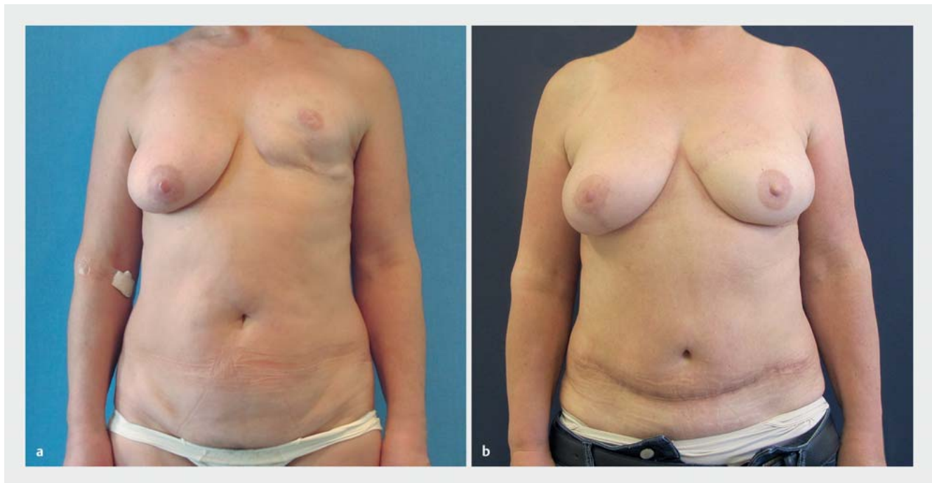
► Fig. 4 a Preoperative findings. Patient aged 56 years, status post prosthetic reconstruction and Baker grade III capsular contracture. b Postoperative outcome. Patient outcome 36 months after prosthesis removal and left-sided DIEP flap reconstruction.