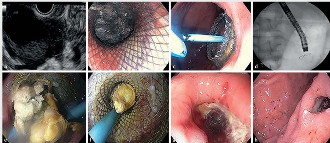
► Fig. 1 Endoscopic ultrasound (EUS)-guided placement of a lumen-apposing metal stent (LAMS) for the management of pancreatic walled-off necrosis (WON) in a 59-year-old man. a An adult echoendoscope was advanced to the stomach and revealed a large heterogeneous hypoechoic collection with internal isoechoic debris suggestive of WON. Under EUS guidance, a 20 mm × 10 mm electrocautery-enhanced LAMS was placed through a transgastric approach creating a cystgastrostomy. b The echoendoscope was exchanged with a gastroscope and the stent position was examined. A copious amount of necrotic solid component was seen from the proximal end of the stent. c,d The gastroscope was advanced through the LAMS and necrosectomy was performed. A 7 Fr × 5 cm double-pigtail plastic stent was then deployed to enhance drainage and prevent occlusion. e,f At 10 days following the initial procedure, repeat upper endoscopy showed a partially occluded LAMS with semi-solid necrotic content, which was then partially removed with a raptor forceps and a large amount of lavage with sterile water. The decision was made to leave the LAMS and the plastic stent for another 2 weeks. g,h Following the complete resolution of WON, the LAMS and the double-pigtail plastic stent were removed, using a raptor forceps.